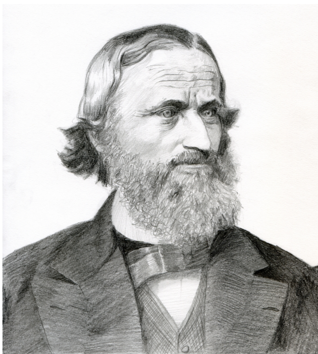
Gustav Robert Kirchhoff (12 March 1824 – 17 October 1887)